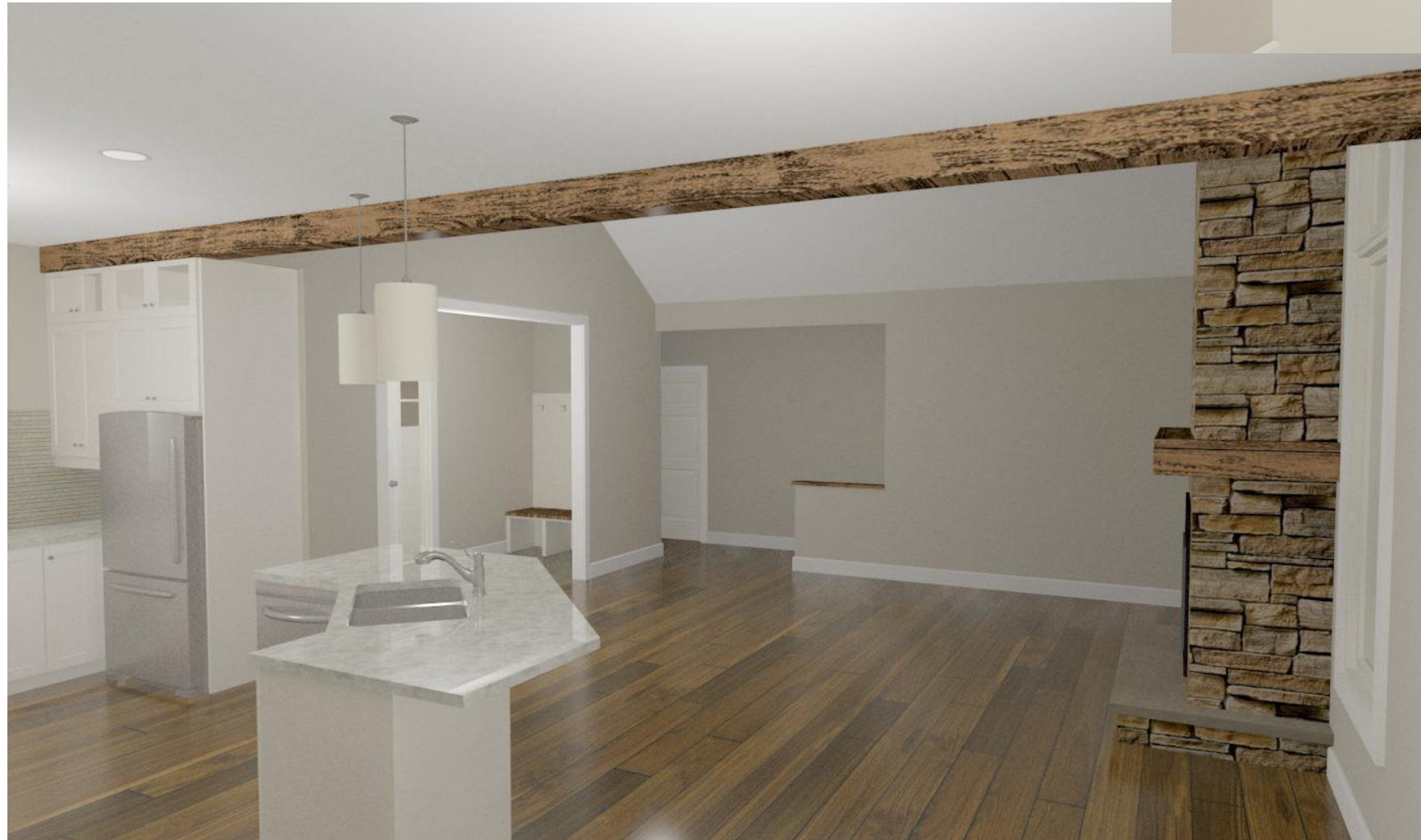
KITCHEN / LIVING