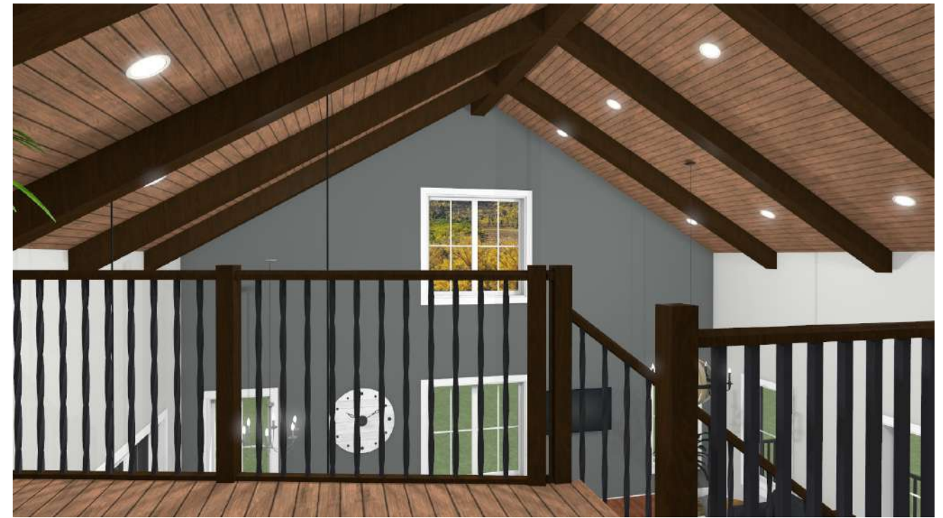
VIEW FROM LOFT