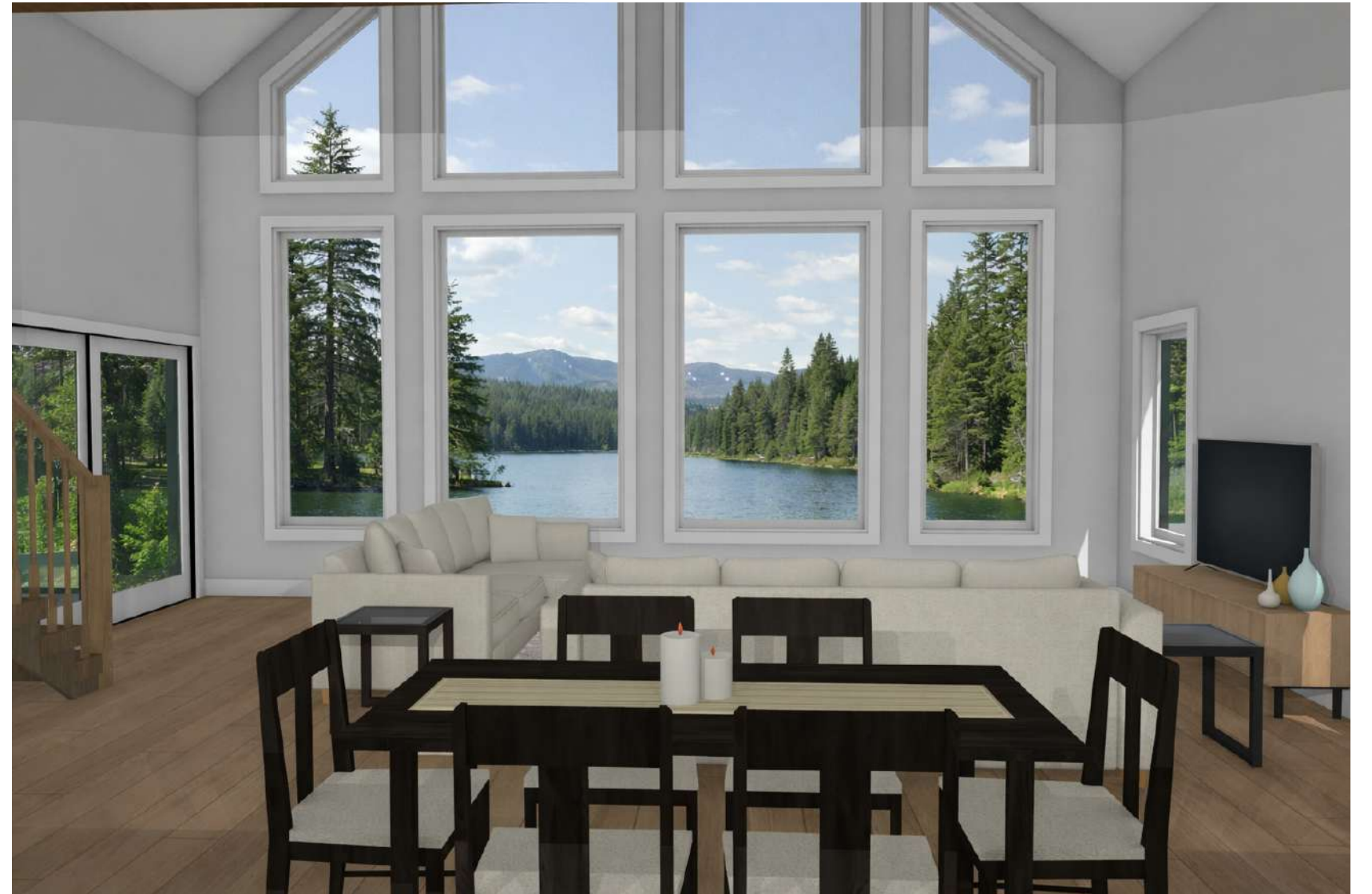
LIVING & DINING