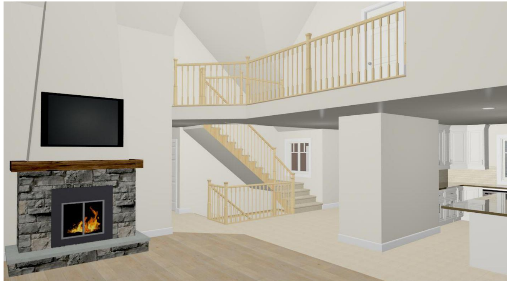
KITCHEN / ENTRY