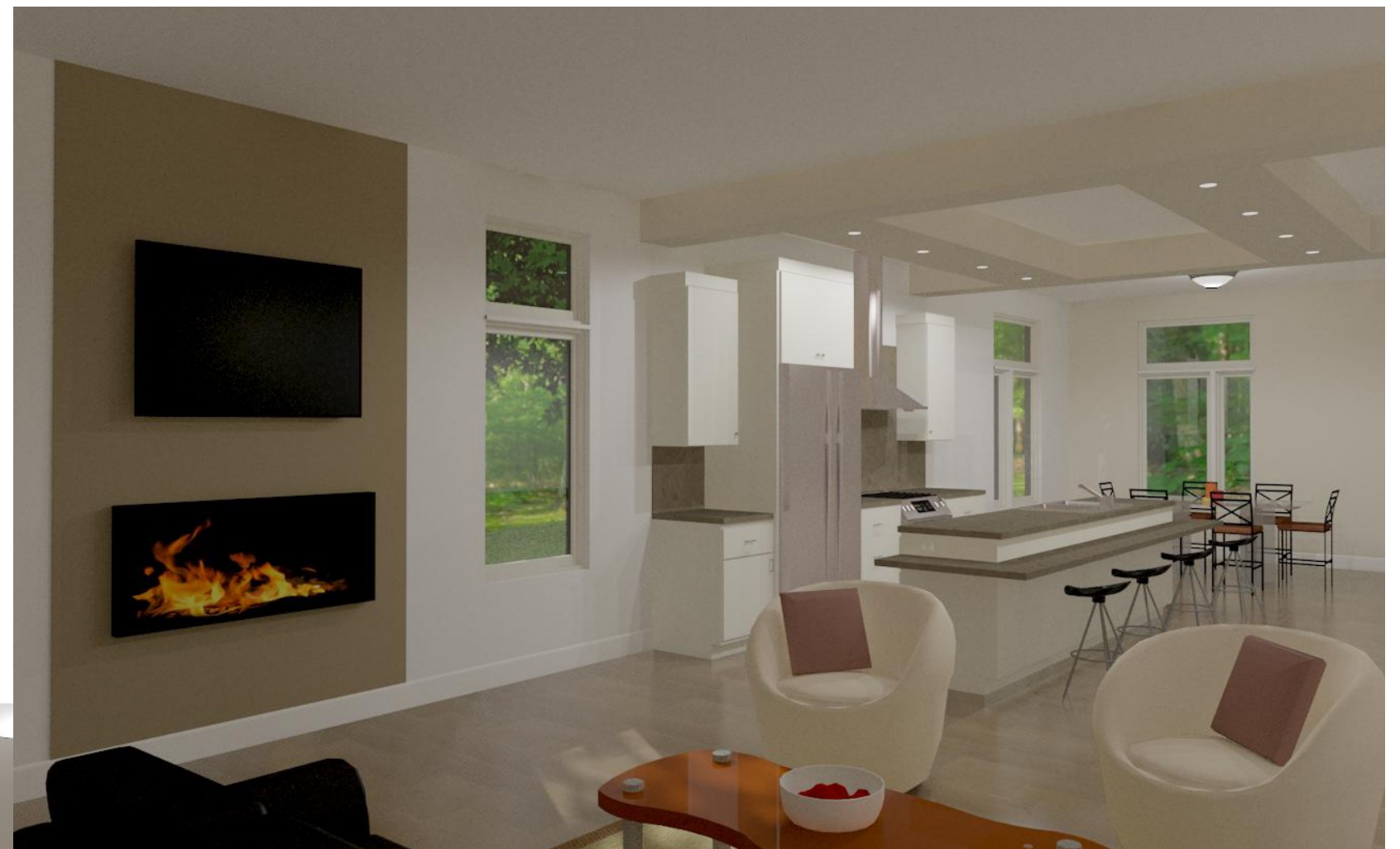
LIVING / KITCHEN