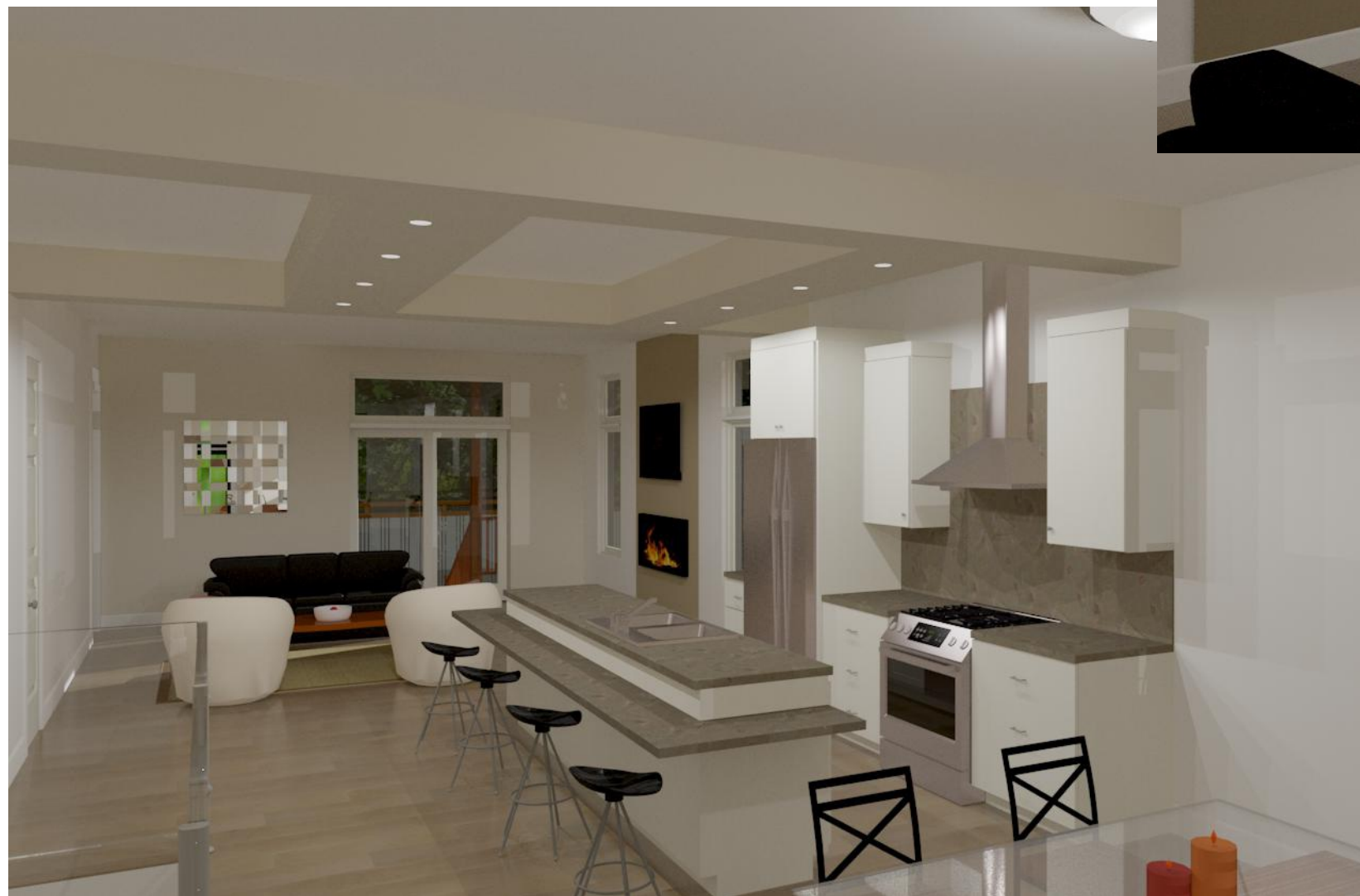
KITCHEN / LIVING