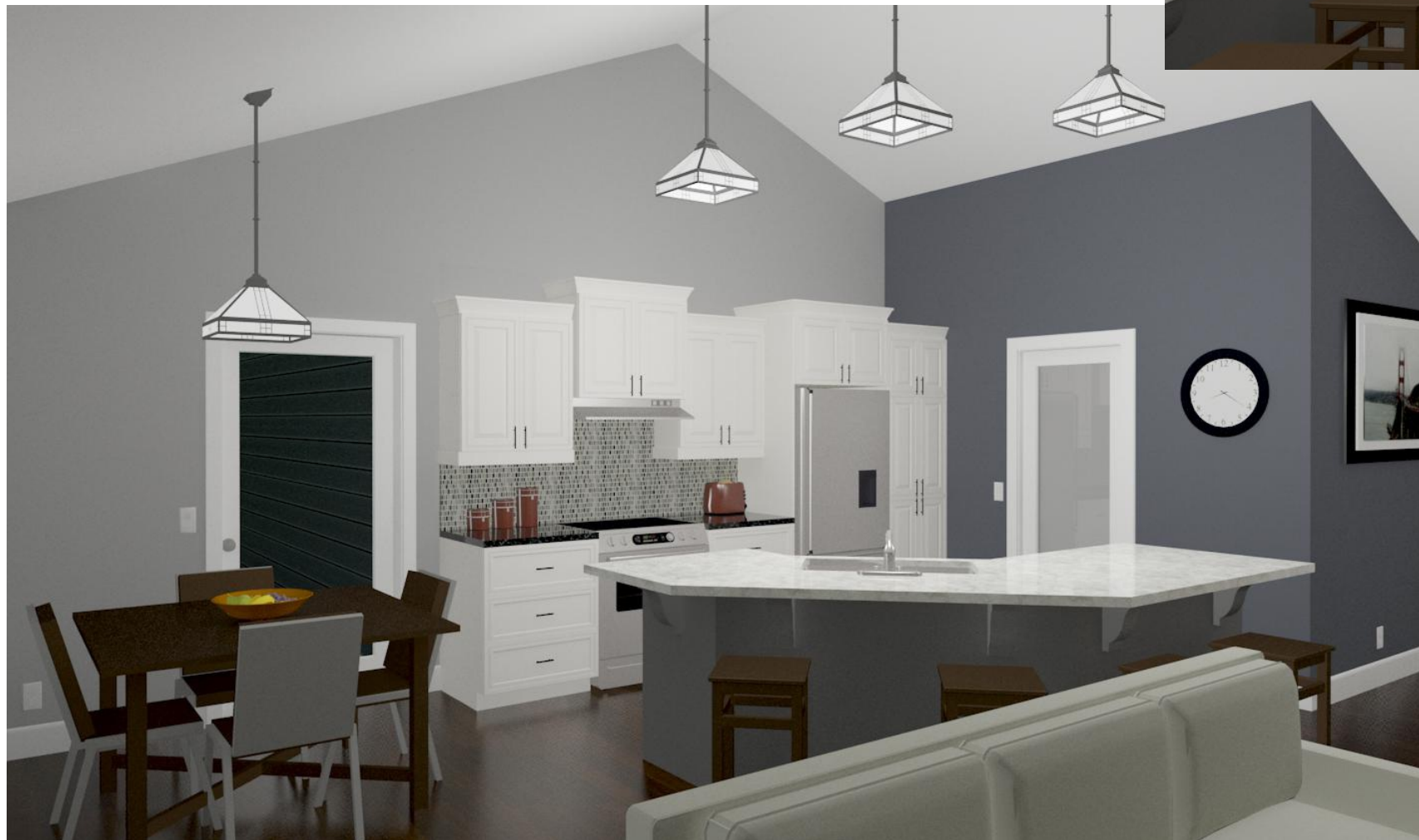
KITCHEN / BREAKFAST