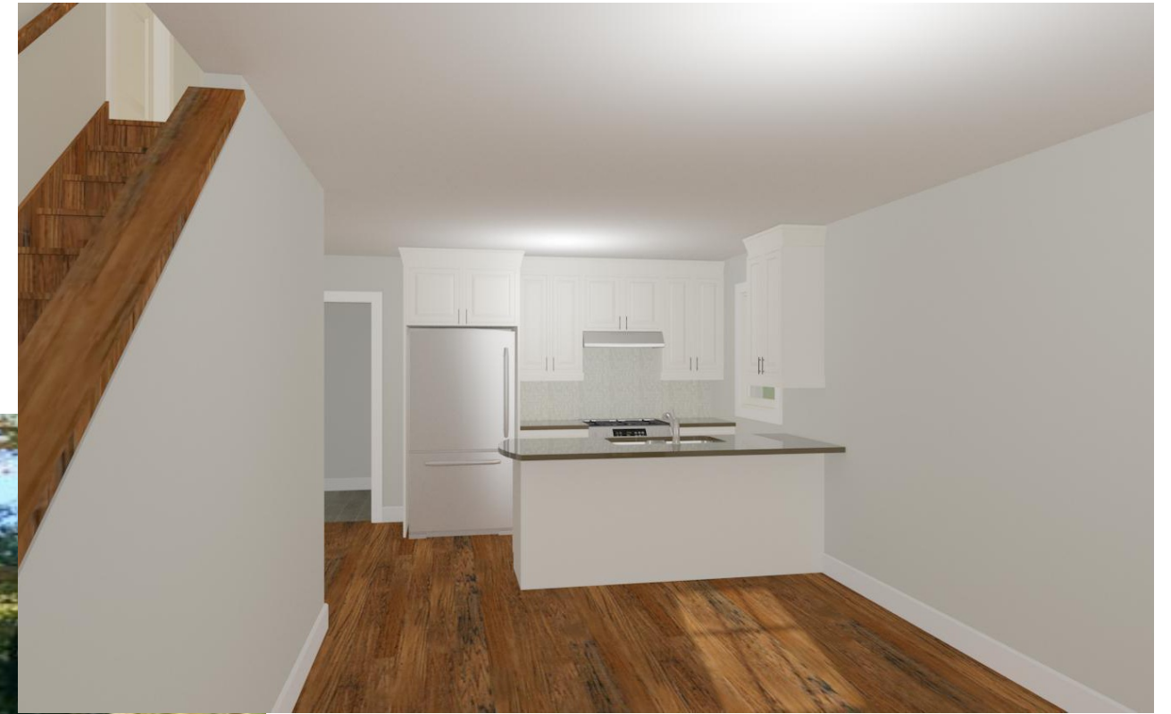
KITCHEN / LIVING